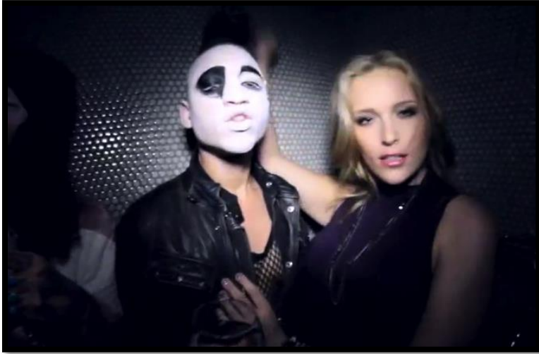
Travie McCoy's "Move It Girl" Video https://vimeo.com/204416469