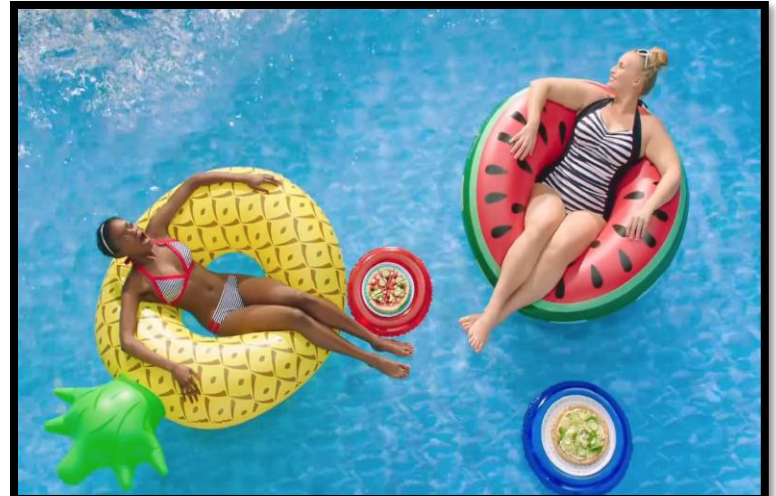
Target Commercial: Full On Summer https://vimeo.com/204415736