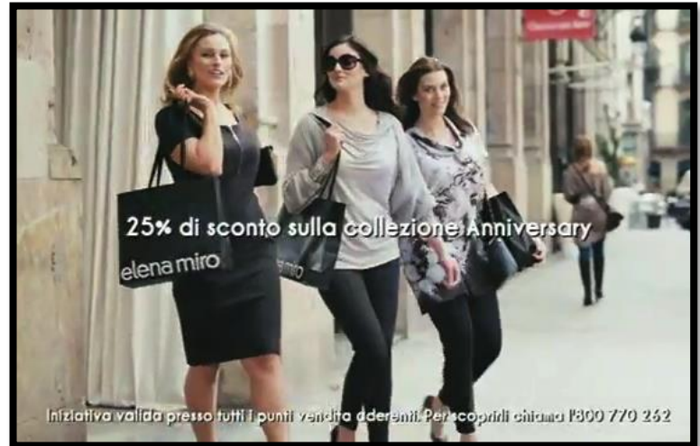
Elena Miro "25 Years" https://vimeo.com/204416292