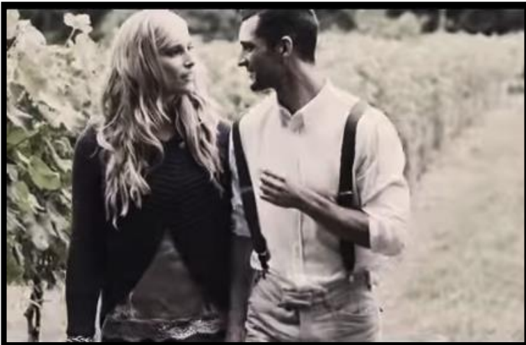
Italian Vogue "For.Me" https://vimeo.com/204416647